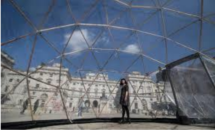
London's Pollution Pods from the inside.