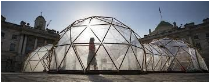
Portland's Pollution Pods.

The release of toxic gases increases the rate of global warming and have a direct effect on our present day health.